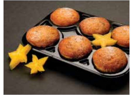
MCP estimates it produces between 150 million and 200 million trays and containers annually for global sales.

Tenenbaume says, within five years, manufacturing operations in Portage will double with a continued emphasis