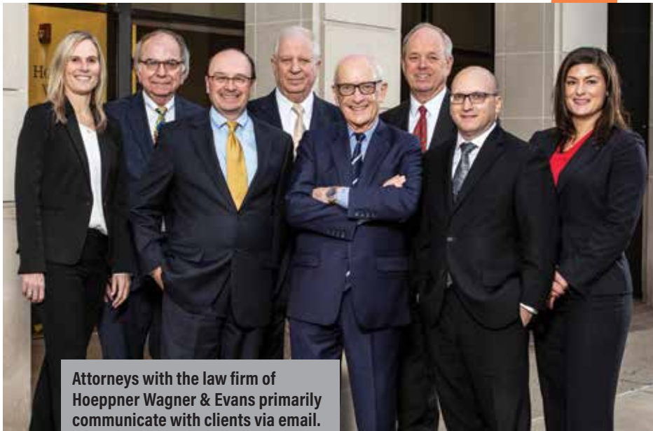
Attorneys with the law firm of Hoeppner Wagner & Evans primarily communicate with clients via email.