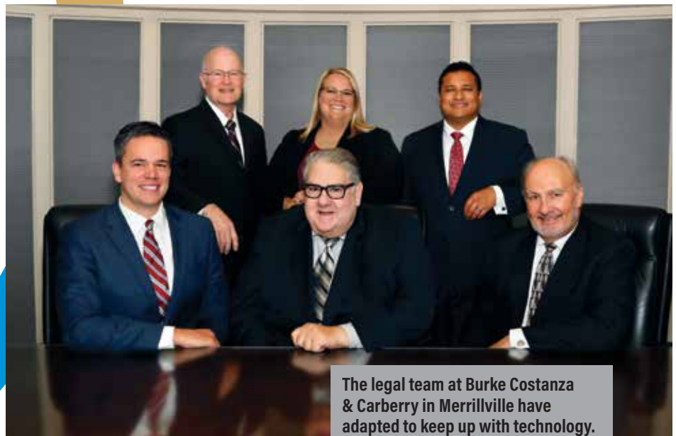
The legal team at Burke Costanza & Carberry in Merrillville have adapted to keep up with technology.

As the world has gone digital, so have attorneys who use websites and social media to connect or provide helpful