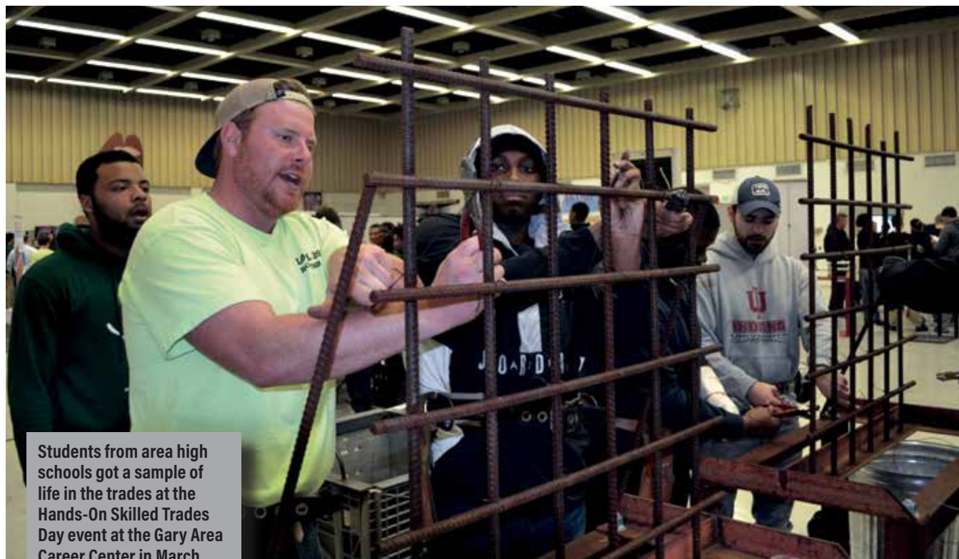
Students from area high schools got a sample of life in the trades at the Hands-On Skilled Trades Day event at the Gary Area Career Center in March.

Health care, construction industries among those Region groups developing talent pipelines