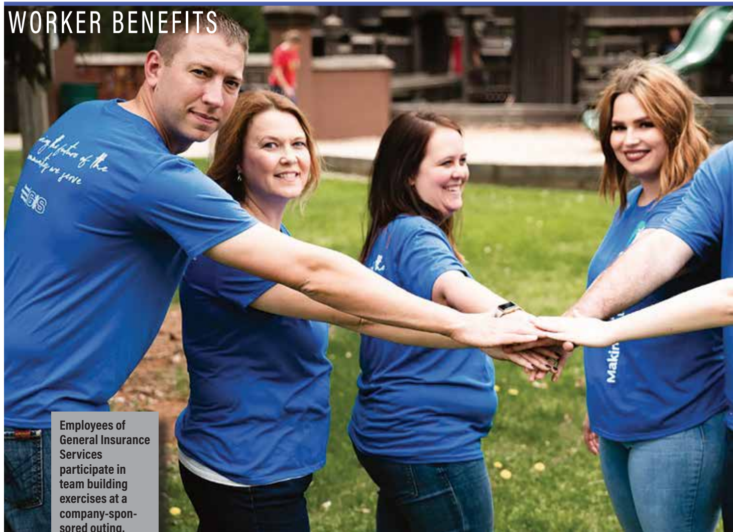
Employees of General Insurance Services participate in team building exercises at a company-sponsored outing.